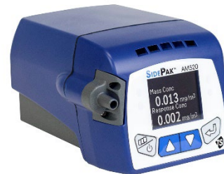
TSI SidePak AM520 Personal Aerosol Monitor

The equipment was set to a one-minute log interval, which averages the previous 60 one-second measurements. For each venue, the first and last minute of logged data were removed because they are averaged with outdoor and entryway air. The remaining data points were summarized to provide an average \text{PM}_{2.5} concentration within each venue. The Kentucky Center for Smoke-free Policy (KCSP) staff trained Pendleton County community advocates who did the sampling and sent the data to KCSP for analysis. Sampling was discreet in order not to disturb the occupants' normal behavior.