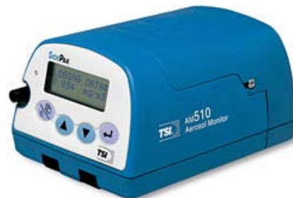
TSI SidePak AM510 Personal Aerosol Monitor

Before the smoke-free law, McCracken County hospitality venues were visited from August 25 to 27, 2005 (Thursday through Saturday). The average size of the eight venues located within the