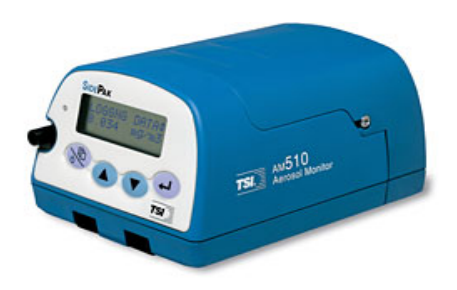
TSI SidePak AM510 Personal Aerosol Monitor

Between September 27 and October 17, 2013, indoor air quality was assessed in 10 indoor workplaces located in Montgomery County, Kentucky. Of the 10 workplaces, sites were of various sizes; some sites were individually owned establishments and some were part of local or national chains.