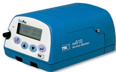
TSI SidePak AM510 Personal Aerosol Monitor

Between August 14-31, 2015 indoor air quality was assessed in eight indoor workplaces located in Marion County, Kentucky. Of the eight workplaces, sites were of various sizes and they were individually owned establishments.