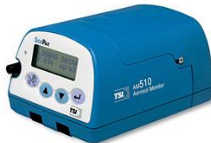
TSI SidePak AM510 Personal Aerosol Monitor

Between May 25, and May 31, 2011, indoor air quality was assessed in 10 indoor workplaces located in Jackson County. Of the workplaces that were chosen, five workplaces were voluntarily smoke free, while the remaining five allow smoking. This was done in order to