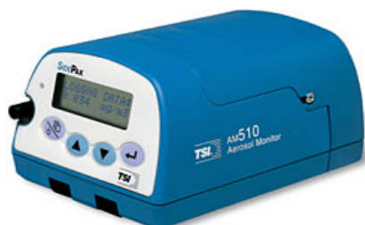
TSI SidePak AM510 Personal Aerosol Monitor

Between November 8 and December 12, 2013, indoor air quality was assessed in five indoor workplaces located in Greenup County, Kentucky. Of the five workplaces, sites were of various sizes; some sites were individually owned establishments and some were part of local or national chains.