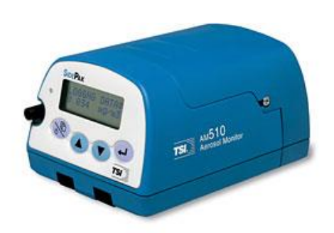
TSI SidePak AM510 Personal Aerosol Monitor

The equipment was set to a one-minute log interval, which averages the previous 60 one-second measurements. For each venue, the first and last minute of logged data were removed because they are averaged with outdoor and entryway air. The remaining data points were summarized to provide an average PM<sub>2.5</sub> concentration within each venue. The Kentucky Center for Smoke-free Policy (KCSP) staff trained researchers from the Lawrence and Elliott County Health Departments who did the sampling and sent the data to KCSP for analysis. Sampling was discreet in order not to disturb the occupants' normal behavior.