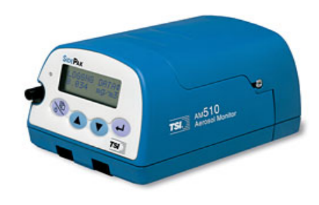
TSI SidePak AM510 Personal Aerosol Monitor

Between November 21, 2013 and April 3, 2014, indoor air quality was assessed in six indoor workplaces located in Caldwell County, Kentucky. Of the six workplaces, sites were of various sizes; some sites were individually owned establishments and some were part of local or national chains.