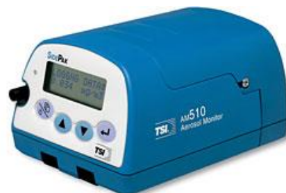
TSI SidePak AM510 Personal Aerosol Monitor

Between June 8, and July 12, 2011, indoor air quality was assessed in 10 indoor workplaces located in Bell County. Sites were of various sizes; some sites were