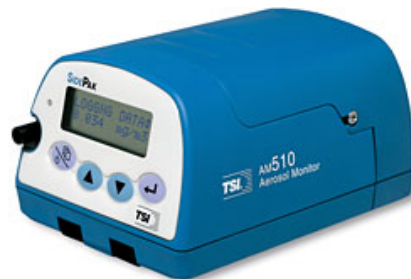
TSI SidePak AM510 Personal Aerosol Monitor

The equipment was set to a one-minute log interval, which averages the previous 60 one-second measurements. Sampling was discreet in order not to disturb the occupants' normal behavior. For each venue, the first and last minute of logged data were removed because they are averaged with outdoor and entryway air. The remaining data points were summarized to provide an average \text{PM}_{2.5} concentration within each venue. The Kentucky Center for Smoke-free Policy (KCSP) staff trained researchers from Smoke Free Campbellsville who did the sampling and sent the data to KCSP for analysis.